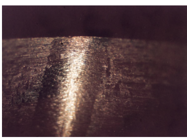
Fig. 1 Groove shape of dies with countermeasures for scrap retention